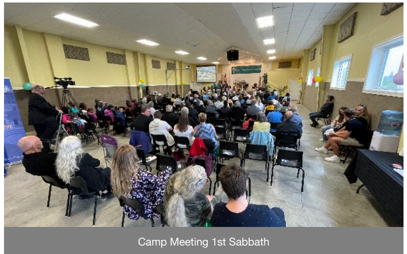
Camp Meeting 1st Sabbath

Addition: A Women's Retreat was added in late September.