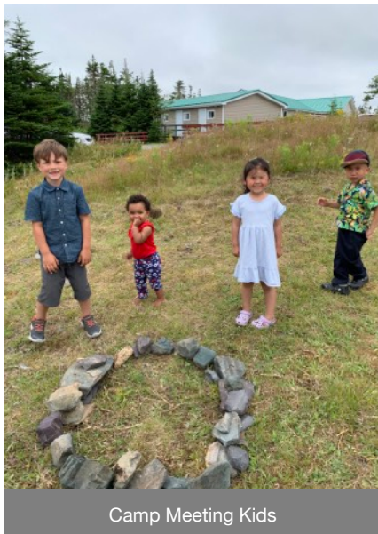
Camp Meeting Kids

Ample time was made this year for our speakers, programs, family time, and free time for individuals to gather for a spiritual revival and much-needed fellowship. Watching everyone together after a three-year closure was beautiful. People were excited to sit and chat, to see the little ones run around the camp, and experience all the joys that camp has to offer.