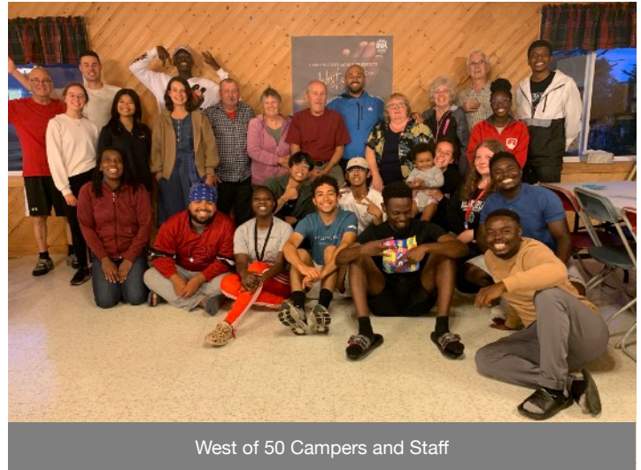
West of 50 Campers and Staff

West of 50 Camp is the first-ever camp for individuals 50+ (with exceptions). This camp included praise, fellowship, and group activities. We had 6 participants in attendance, and everyone had a bundle of fun. Comments flooded in, "I have never felt this young in a long time," "Everyone here is so much fun, I really can't wait for next year to be longer," and "I would have never tried any of these things if I didn't come here. This is wonderful, and I get to be a kid again." Our campers had the experience of a lifetime while enjoying all the activities of a junior camper—archery, painting, music, board games, tubing, paddle boat, boat rides, etc. We hope to see more individuals for our West of 50 camp next year.