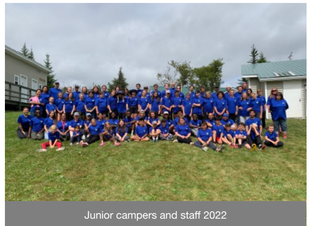
Junior campers and staff 2022

Junior Camp 2022 had a record registration of 60 campers! We had 55 campers settle in on registration day for a fun-filled week. Our campers were able to experience a week of "Love Your Selfie," which focused on seeing ourselves through the eyes of Jesus. Our worship and class times brought out our daily themes and allowed us to apply our lessons practically. All the staff and volunteers were pleasantly surprised by each child and teen who were represented at Camp. You could watch the attitudes change as the young people walk towards their classes or cabins laughing, smiling, and sharing their favorite moments of the day.