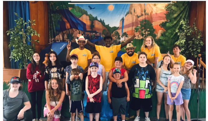
In photo: Bay Roberts VBS crew 2022