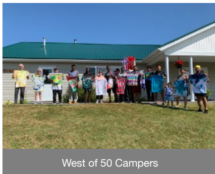
West of 50 Campers