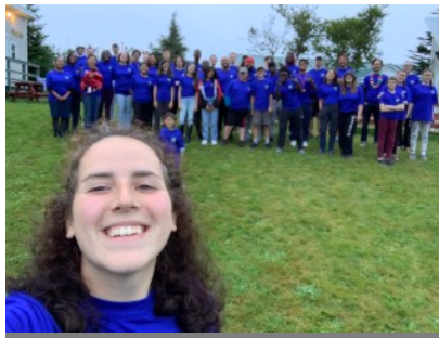
DiscipleTrek Campers and staff