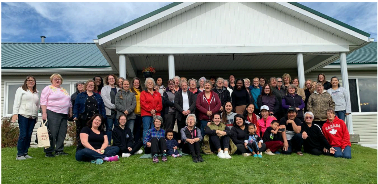
Women's Retreat 2022

It was an exhilarating summer for Camp Woody Acres. Running for a total of 8 weeks with six weeks of programs was our most extended summer in several years. Next year our goal is to increase by an additional week and continue to grow and develop our camping program. Upcoming dates include: