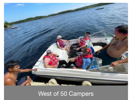
West of 50 Campers