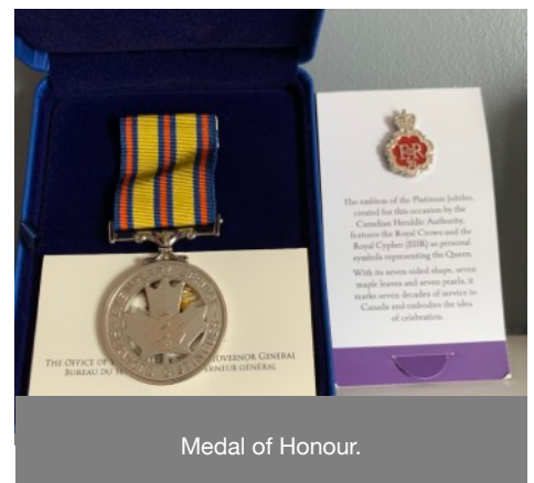
Medal of Honour.

This prestigious award is rewarded to practitioners who served the EMS field for a minimum of 20 years and have been on the front line with at least 10 of those. This medal is not simply a year of service award but is given for exemplary service during years of service.