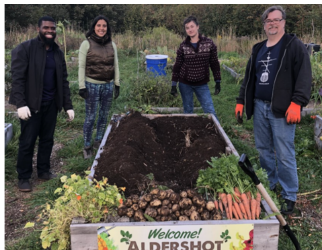
Community Garden volunteers with fall harvest.

A new pilot project in the garden this year saw the construction of a 4-ft high raised bed for a gardener with mobility issues. This allows the gardener to tend their bed while standing; we hope to build more of these next year if we have requests for them, so that seniors and people with disabilities can also participate in the garden