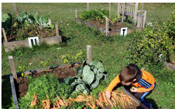
Young 3 year old gardener pulling his carrots.

The Marystown Seventh-day Adventist Church took advantage of the 2020 Adventist Community Service funds to begin building a community garden on the church property. The purpose of this community garden was to do outreach. Hoping that this area could support low-income families, such as single-parents and the elderly, and many mental health difficulties, and those battling loneliness, depression, and anxiety.