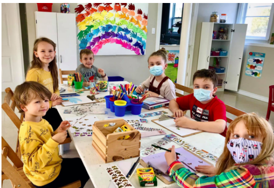
A few children ready for a day of activities.