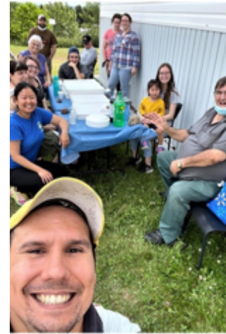
Central church family gathered at the Botwood SDA Church for workbee.

who were not able to make it that day also helped prior to the date in repairing and painting our wheelchair ramp. We enjoyed a pizza picnic on a beautiful day and were all smiles – as you can see from the picture!