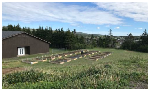
25 beds at beginning of season.

The goal of the garden was to build friendships in the church and community, give the youth group a project, promote health messages, and encourage the community to get outside throughout the week.