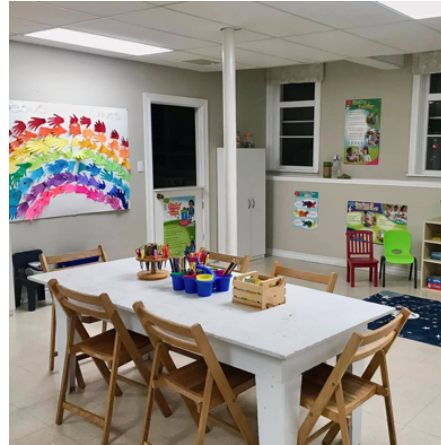
New Horizons Homeschool Co-op classroom setup in the church basement.

Why did you begin this program? “I would have to say the need for a community of children to grow and learn together in a safe and God centered environment. We have been a long time desiring an Adventist school here on the island but big ideas, such as starting a school, take a lot of time and patience. Until then we needed something that would meet the present need. I have three children, two of whom are school aged, who have been homeschooled for a few years now. I had been praying that God would provide more for them in their learning experience. I also was in need of more support in educating them for God’s kingdom. I prayed for His will to be done, whatever that was. I thought maybe He will send a missionary teacher or somehow a school would start up. What this has come to be was not something I really expected. Homeschooled children, especially from Christian families, will always have that desire of a wholesome community of friends for their children to associate with. With a homeschool co-op several needs are met such as supporting parents in educating their children, providing a safe community to learn within, and most importantly offering these children and parents an opportunity to learn more of Jesus each and every day.”