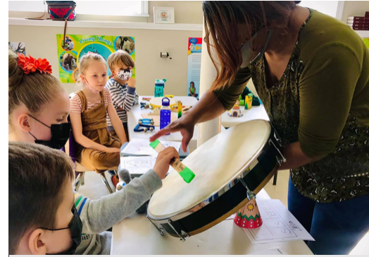
Music class with church volunteer.

What Are Your Hopes for the Island? “We actually are praying that more churches can start something like this in their area, because no matter where you go across the island there are families who are homeschooling and looking for such things as we are providing through New Horizons Co-op. Not only can we provide for our own church children’s education needs through this means but also for many families in search for this type of learning environment within our surrounding community. As Jesus gives us example, it’s a way to become friends with others and meet a need that they have and in turn share more with them about Jesus. It’s showing people we care about them and their families and that we are here to help and support.”