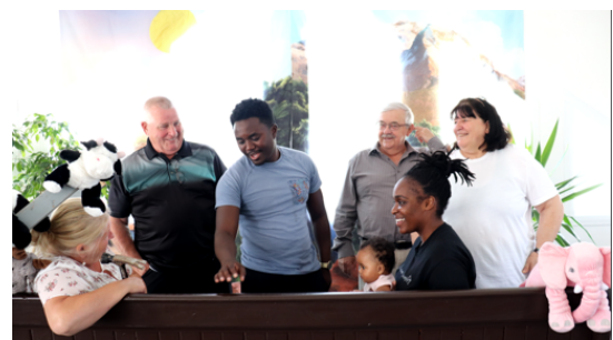
Bonavista VBS group picture.