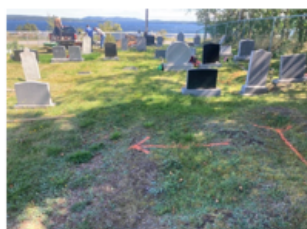
Before and after cemetery repairs.

CEMETARY REPAIRS - After contacting family members who had concrete forms in the Botwood cemetery, permission was received to renovate. After cutting through, breaking up, and disposing of the concrete forms, they filled the sunken graves with topsoil and will be laying grass seed in the Spring. They have also modified