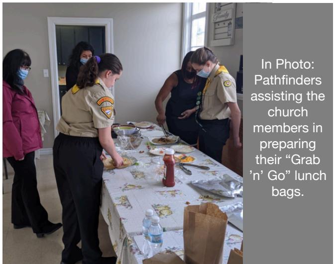
In Photo: Pathfinders assisting the church members in preparing their "Grab 'n' Go" lunch bags.