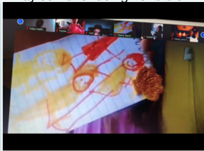
Hilarie Rasch showing her family picture.