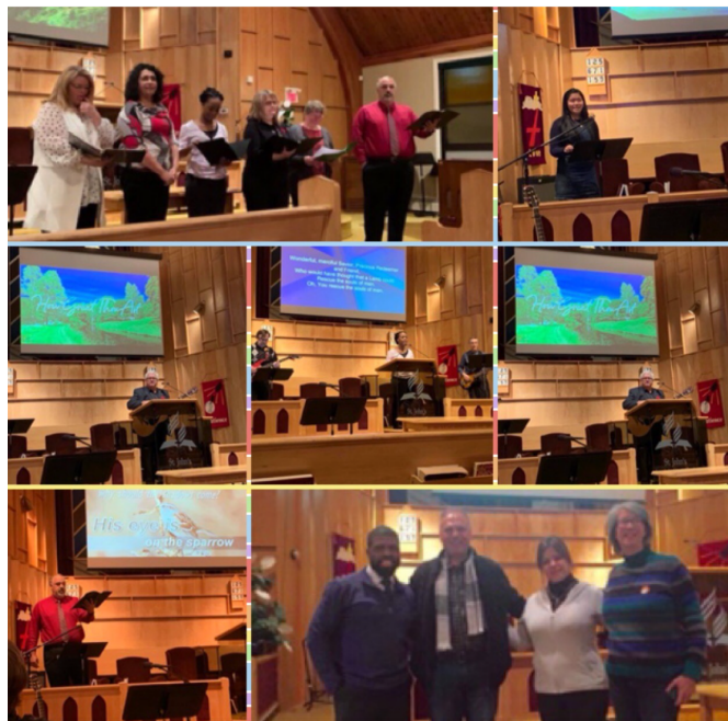
In photos are the various performers in the 'One Voice' Concert.

On Saturday, November 9th, the St. John's Seventh-day Adventist Church held a benefit concert for the Nateghi family, a refugee family from Iran who have recently arrived in Newfoundland. The program celebrated the talents of the diverse congregation. The performers in the program were born in Botswana, Canada, Cuba, Cyprus, El Salvador, Jamaica, Montenegro, the Philippines, and Zimbabwe. Together from many nations, they lifted their voices in scripture and praise to our one Lord."