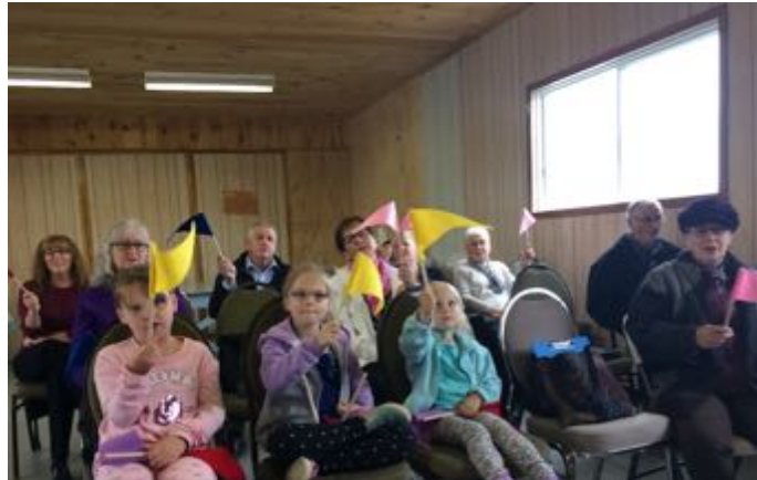
Cape Freels church enjoying song service together