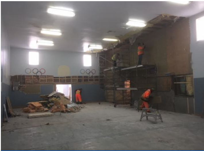
Removal of the gym wall