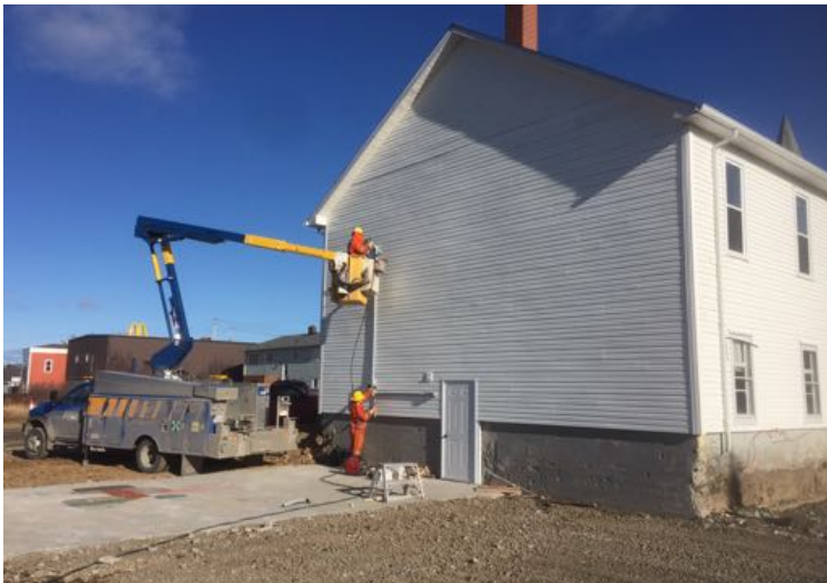
Finishing the back of church