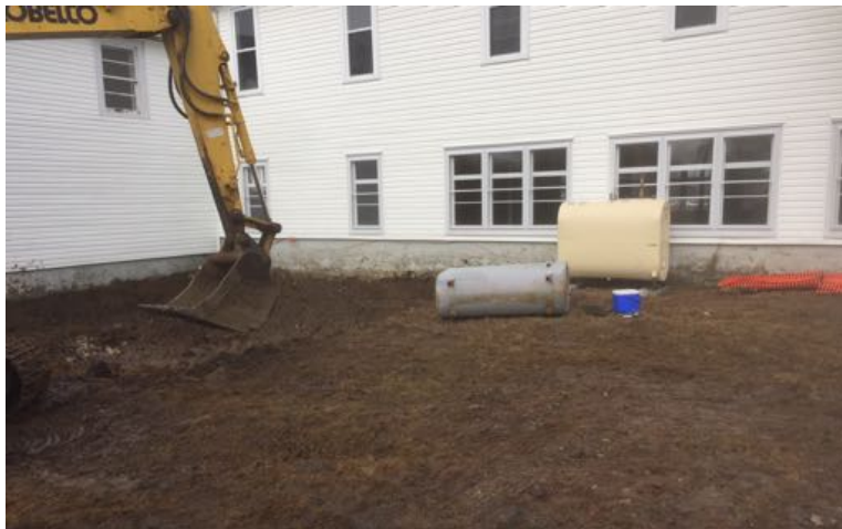
Installation of temporary tank | Photo by Bruce Smallwood | NL Adventist Communications

After considering the option of digging up the gym floor, it was voted that the most cost-effective method was to tear down the gym. Thanks to Bruce Smallwood who ran a generator three times per day beginning around 5 AM and ending around 10 PM, for a week, to keep the furnace running to heat the church. Removing the gym delayed the cleanup of the contaminated ground for a few weeks; however, work has resumed this week and will continue until completed.