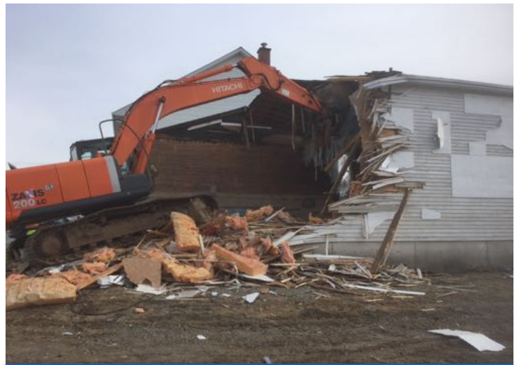
Removal of the gym wall