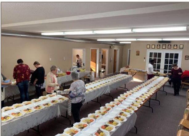
Helpers gathered together to assemble Cold Plates | NL Adventist Communications