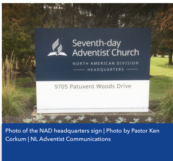
Photo of the NAD headquarters sign