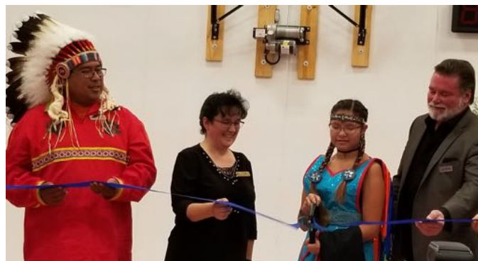
The official opening of the high school, Mamawi Atosketan Native School