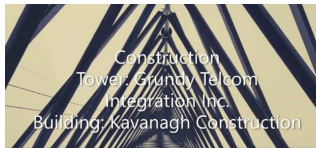
Photo of the inside of the tower | Watch video at: https://vimeo.com/287108612