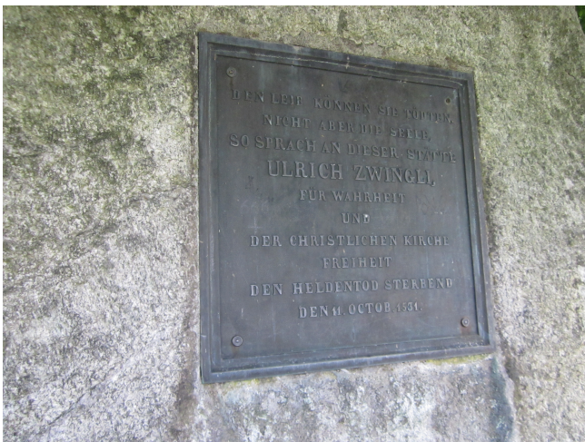
(2) Zwingli Plaque | June, 2018

(1) Shows the center piece of the Reformation Wall in Geneva, Calvin is second from the left. At the centre of the Wall are statues of William Farel, John Calvin, Theodore Beza, and John Knox.