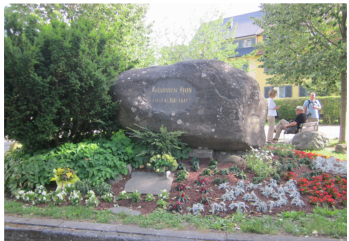
(5) Place of Martyrdom of Hus & Jerome | June, 2018

(6) The gate of Constance where Huss would have walked through on his way to a martyr's death in Constance, Germany. Then there are (5) the plaques at the location where both he and Jerome were burned at the stake for preaching the Bible and condemning the abuses of the Church at the time.