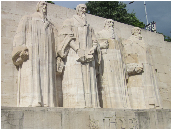
(1) Center Piece of the Reformation Wall | Geneva, Switzerland