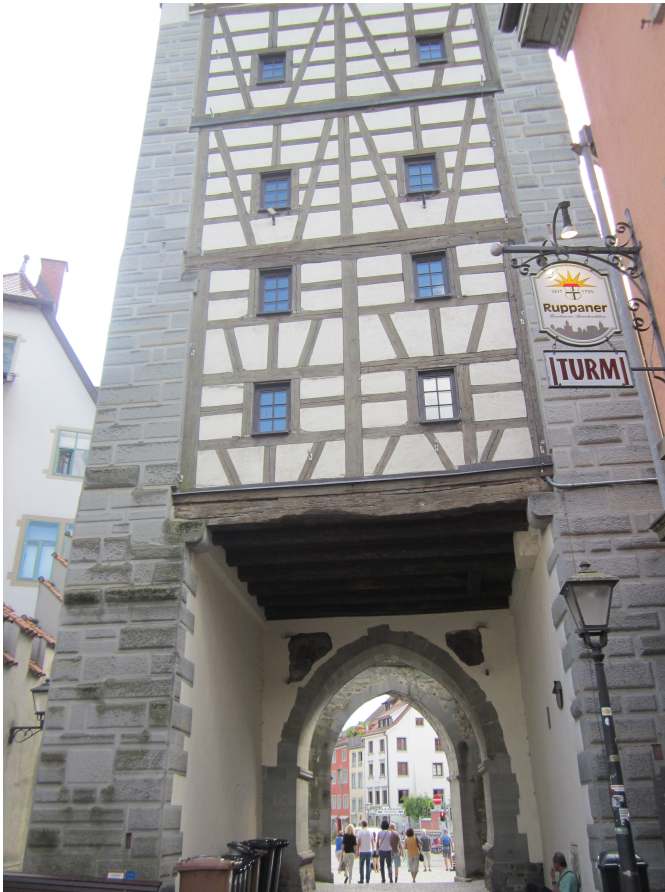
(6) Gate of Constance