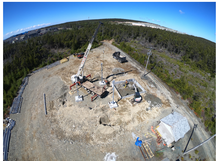
Aerial View of VOAR FM Tower

Grundy Telcom Integration Inc. is heading up the tower building project and Cavanagh Construction is building the metal sided utility building. Weather permitting, they are hoping to have the project completed within the next several weeks.