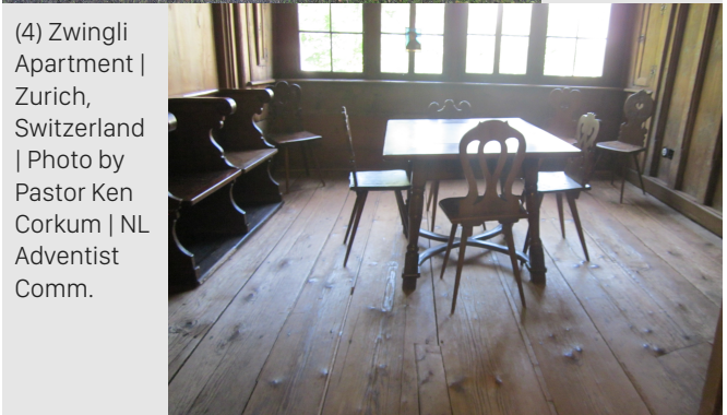
(4) Zwingli Apartment | Zurich, Switzerland

(6) The gate of Constance where Huss would have walked through on his way to a martyr's death in Constance, Germany. Then there are (5) the plaques at the location where both he and Jerome were burned at the stake for preaching the Bible and condemning the abuses of the Church at the time.