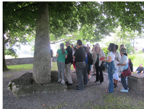
(3) Battle Site, Zwingli | Zurich, Switzerland

(3) The Zwingli pictures, (2) the plaque that honours him at the battle site where he went out with the troops of Zurich as chaplain and died. (4) The preserved apartment where he lived.