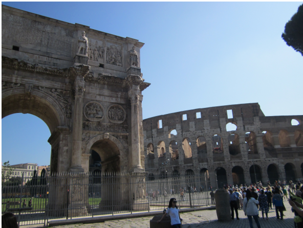
Photo #1: Arch of Constantine Near Colosseum