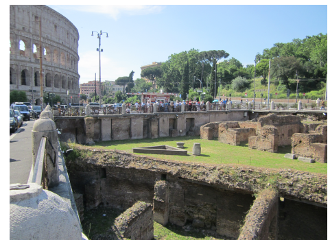
Photo #7: The Gladiator School