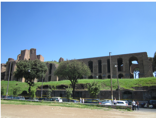
Photo #4: Palatine Hill

7. The Gladiator School with entrance that would go underground to the Colosseum in the background.