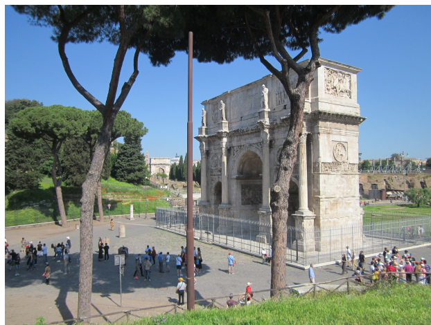
Photo #2: Arch of Constantine