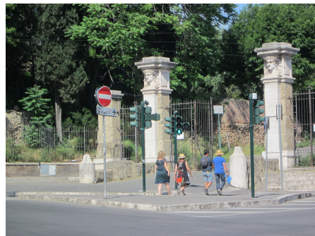
Photo #6: Nero's Property Gates