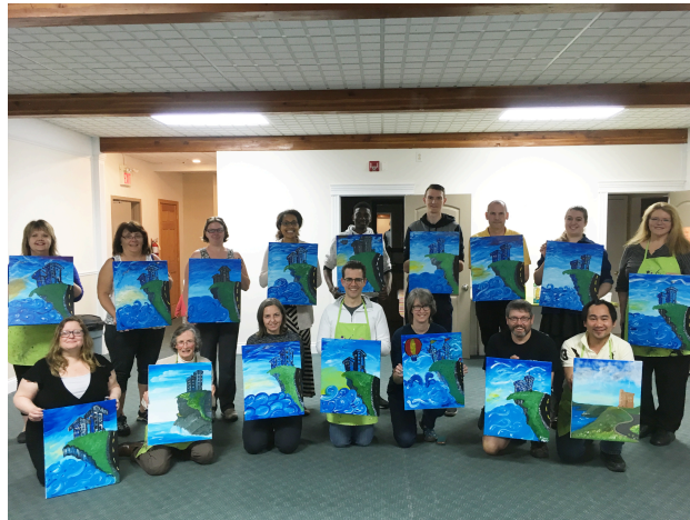
VOAR Paint Nite | St. John's Seventh-day Adventist Church | April 29, 2018