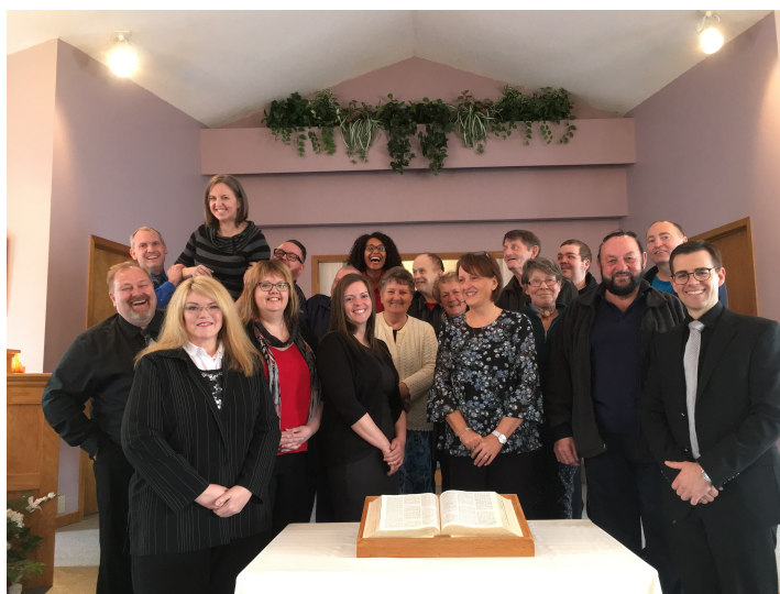
St. John's "One Foundation" with Marystown Members | April 21, 2018