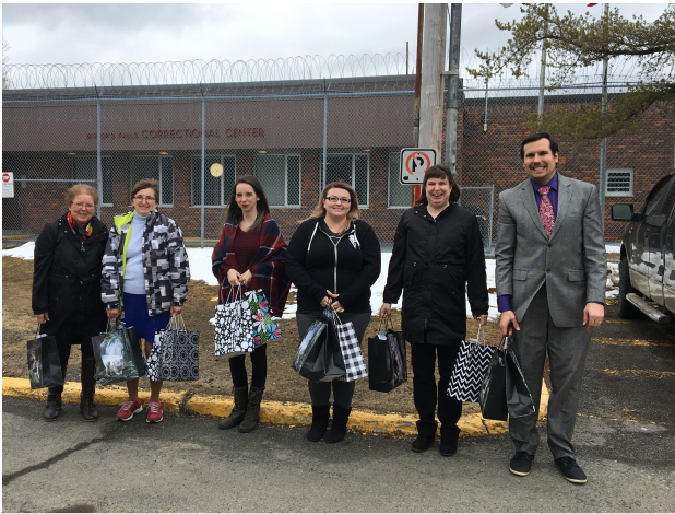
Grand Falls - Windsor SDA Fellowship Spearheads Prison Outreach to Bishop Falls Correctional Facility | April 21, 2018