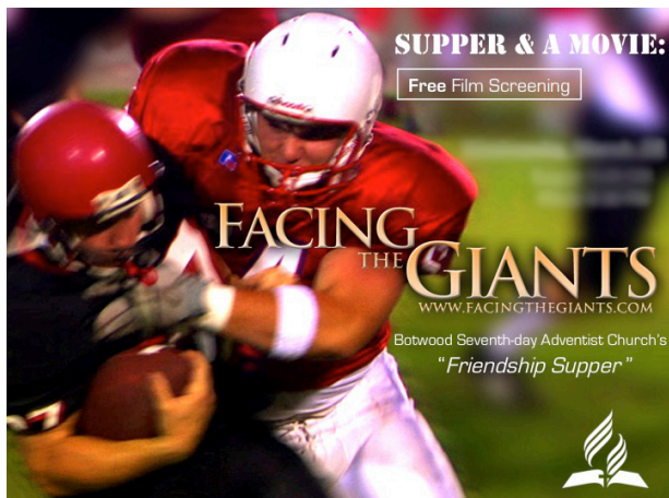
Supper & A Movie | Botwood Seventh-day Adventist Church