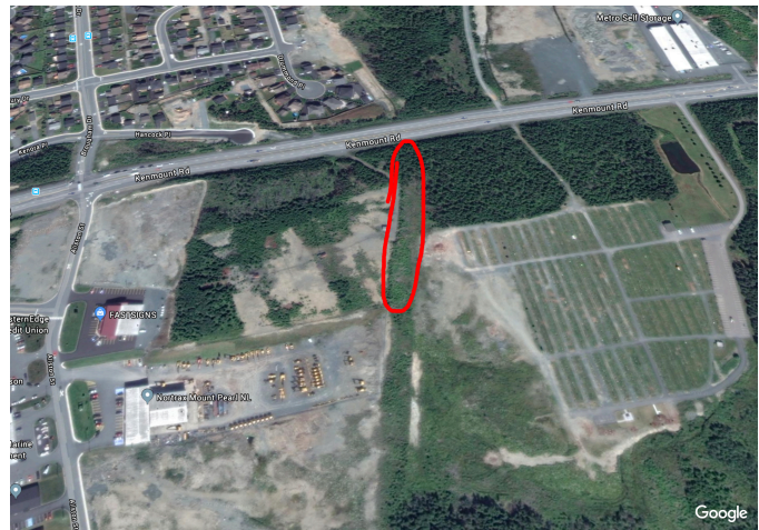
73 Acres of Crown Land Next to VOAR Tower Site | Mount Pearl | | April 5, 2018 | NL Adventist Communications