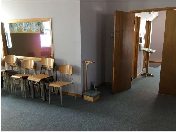
Wooden Stand with Missing Bottle | Marystown Seventh-day Adventist Church | February 17, 2018