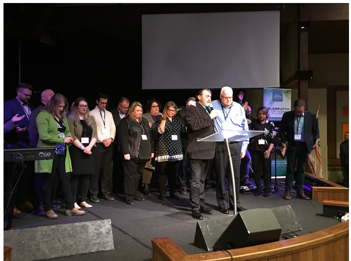
Avalon Celebration of Hope Executive Leadership Team | Bethesda Pentecostal Church | March 8, 2018

Please pray for this endeavour, those who will be participating, and the local community. Please mark your calendars for November 2-4, 2018 as this will be a significant Christian event for Newfoundland and Labrador, the likes of which has not been seen for over 25 years.