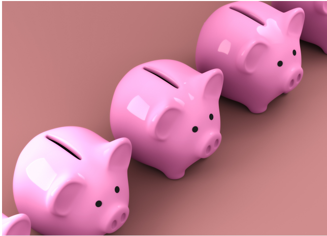
Canadian Retirement Fund for SDA Workers | | NL Adventist Communications