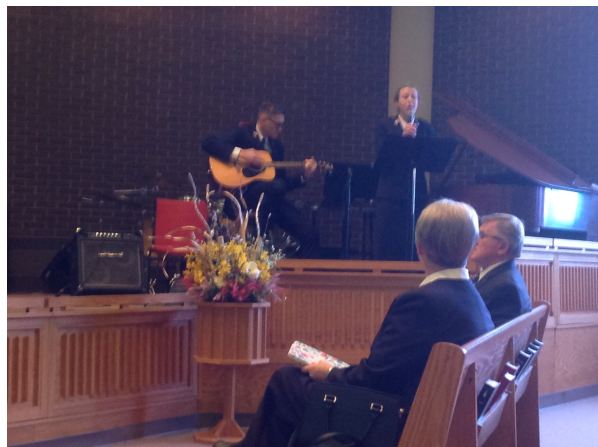
Lent Service at Salvation Army | March 7, 2018

Present for the service were some 80+ worshipers, who responded with warmth and approval to the Bible message of how Jesus interacted with Pilate on the day of His crucifixion.