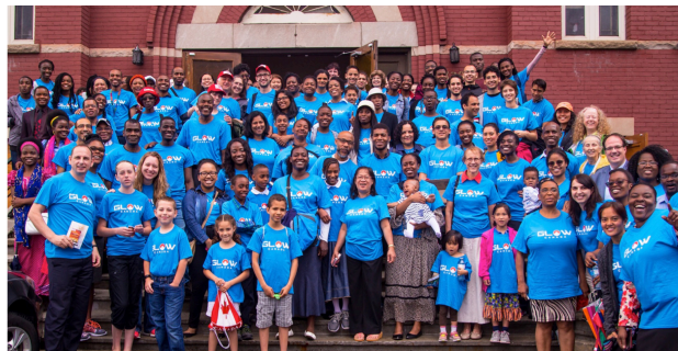
Lifestyle Canada 2017 Team