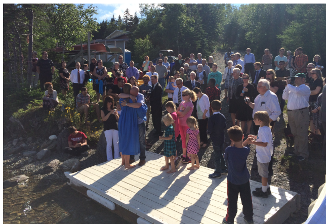
NL Adventist Members Gathered for a Baptism on water front at Camp Woody Acres

The Board of Directors voted in 2017 and again in 2018 to give every church and company in NL the sum of $100/month or $1,200/yr to help the local congregations with outreach ministries. Besides this an additional $1,000 is available for five special requests.