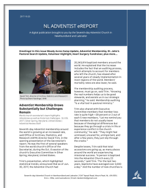
NL Adventist eReport (weekly edition)

The first significant item from NL Adventist communications, is the weekly NL Adventist eReport.