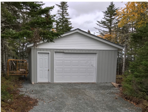
New Maintenance Shed, Camp Woody Acres