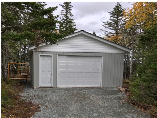
New Maintenance Shed, Camp Woody Acres