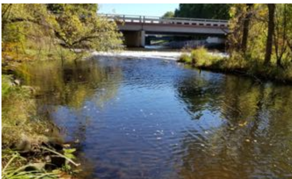
This picture is the baptismal location for Battle Creek between 1855 and 1879. The second location was a few hundred yards further down the river. This site for baptism was about a five minute walk from the church