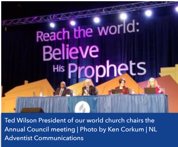
Ted Wilson President of our world church chairs the Annual Council meeting