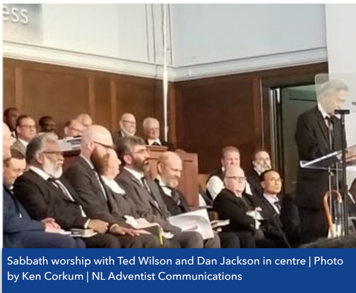
Sabbath worship with Ted Wilson and Dan Jackson in centre